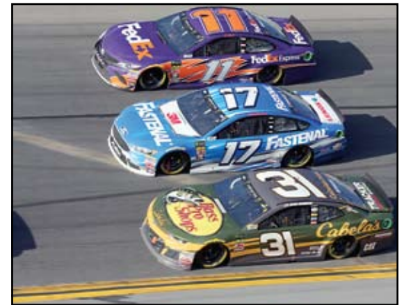
3 WIDE RACIN'