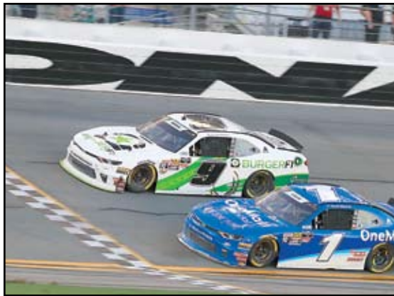
TYLER REDDICK WINS XFINITY RACE BY “THAT MUCH”!!

Attrition was the name of this DAYTONA 500 game, with a series of incidents that took out high-profile contenders. As those drivers were dropping out with stunning regularity during the sun-splashed afternoon, Dillon hung around – and hung tough.