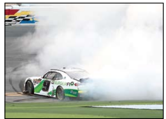
TYLER BURNS THEM UP