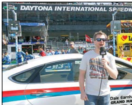
MONSTER CUP GRAND MARSHALL: DALE JR