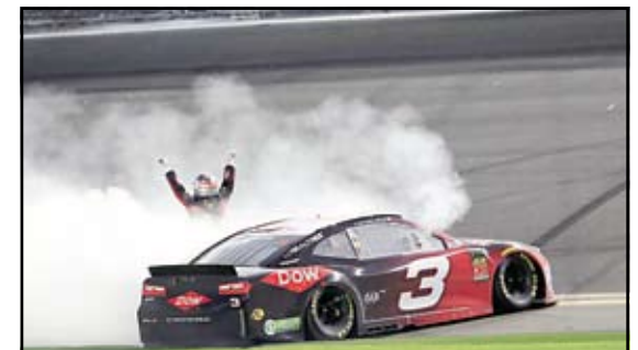
THE #3 IS BACK AFTER A 20 YEAR ABSENCE