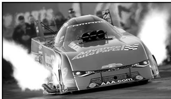
COURTNEY FORCE- PHOENIX FUNNY CAR WINNER

The 47th Annual Gatornationals at Gainesville, Florida will be held on March 17-20. The AutoPlus Raceway event sponsor is Amalie Motor Oil. Visit their website at www.autoplusraceway.com for more details.