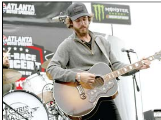
CHRIS JANSON ENTERTAINED FANS DURING RACE DELAY