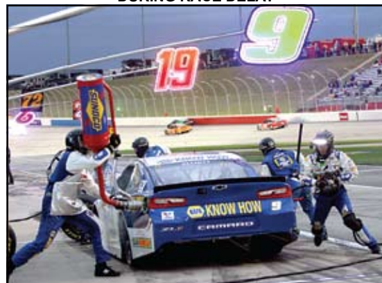
CHASE FINISHED IN 10TH